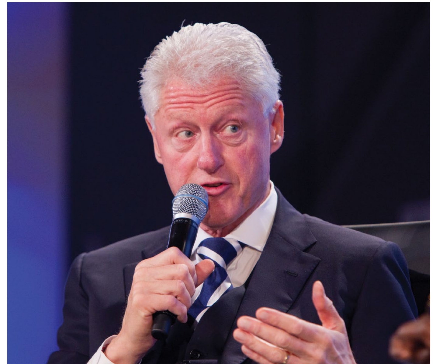
President Bill Clinton

Reaching an agreement will require people to reach across partisan divides that have gotten deeper in recent years. "In the end," President Clinton said, "We have to listen to people who disagree with us."