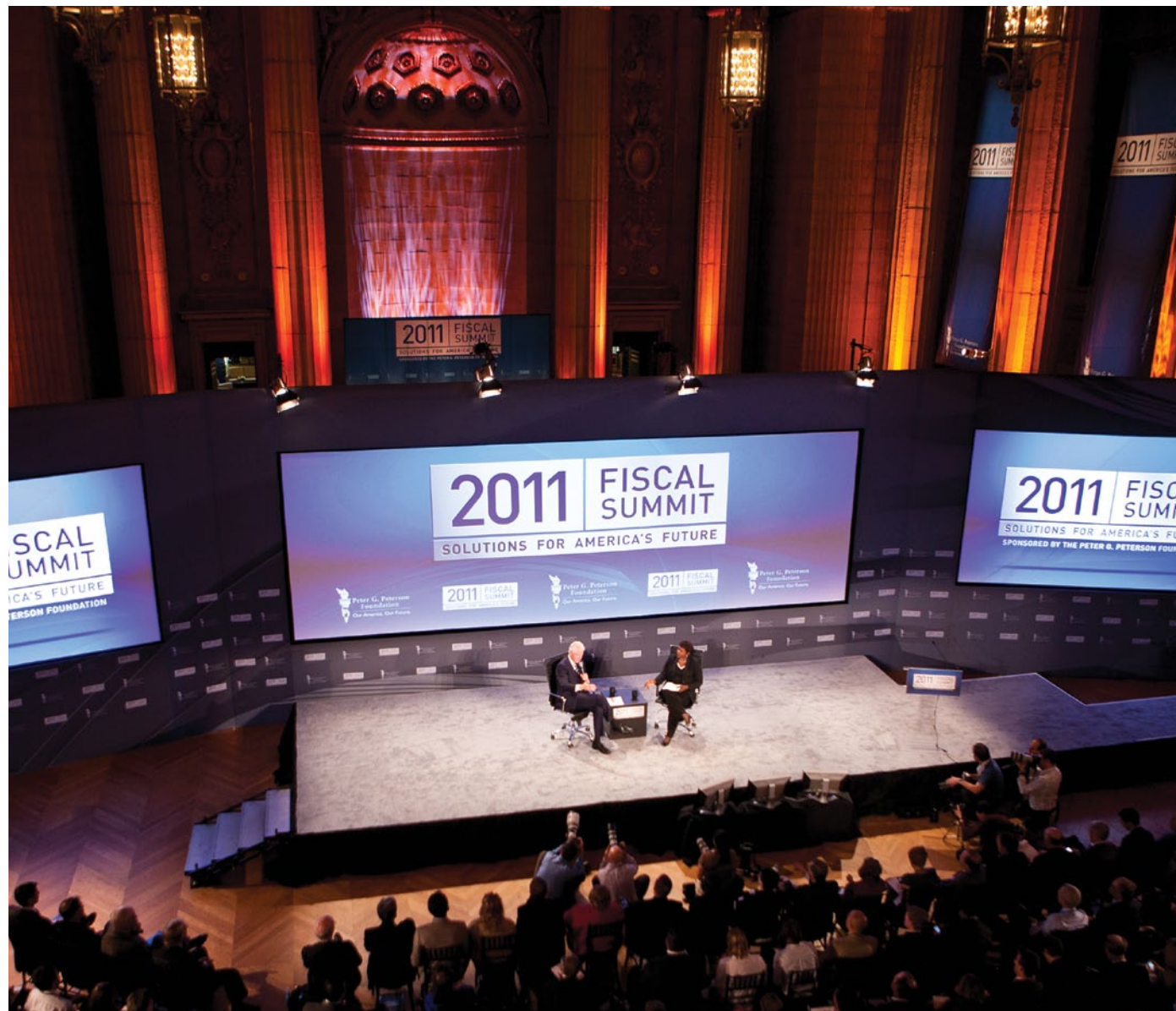
President Bill Clinton and Gwen Ifill

On May 25, 2011, the Peter G. Peterson Foundation convened its second annual Fiscal Summit, focused on “Solutions for America’s Future.” Key policymakers, budget experts, journalists, and business leaders met to explore the factors that contribute to America’s fiscal challenges and help chart a more sustainable course for the future.