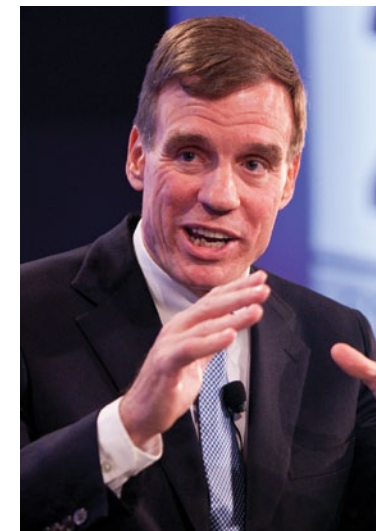
Senator Mark Warner

On entitlements, Senator Durbin argued strongly that Social Security and the rest of the safety net should be seen not as anachronistic programs but as real lifelines for people who struggle. He said Americans get nervous when they hear policymakers talk about changing programs they rely on, but noted that the Social Security reform of 1983 was negotiated and enacted on a bipartisan basis and did not cost members of Congress their jobs.