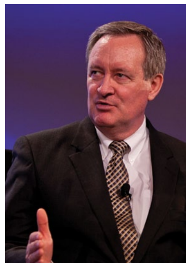
Senator Mike Crapo

For the first time, four members of the bipartisan group of senators working on a long-term deficit-reduction plan – Saxby Chambliss (R-GA), Mike Crapo (R-ID), Dick Durbin (D-IL), and Mark Warner (D-VA) – appeared together to discuss their work and the prospects for fiscal reform.