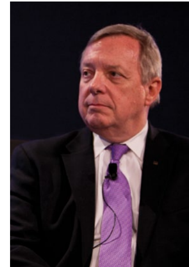
Senator Dick Durbin

Senator Chambliss said corporate tax reform, similar to individual reform, is also important to improve the competitive position of U.S. companies. He said such reform should be revenue-neutral. Senator Durbin said corporate tax reform should protect the existing revenue stream and also treat small and large businesses more equitably.