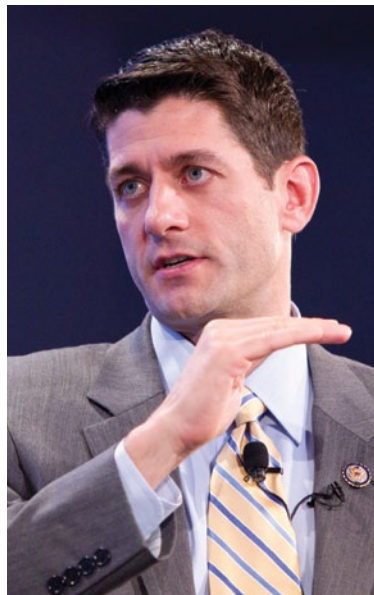
Representative Paul Ryan

CNBC anchor Maria Bartiromo hosted back-to-back conversations with House Budget Committee Chairman Paul Ryan and National Economic Council Director Gene Sperling to explore the deficit-reduction challenge from the perspectives of House Republicans and President Obama.