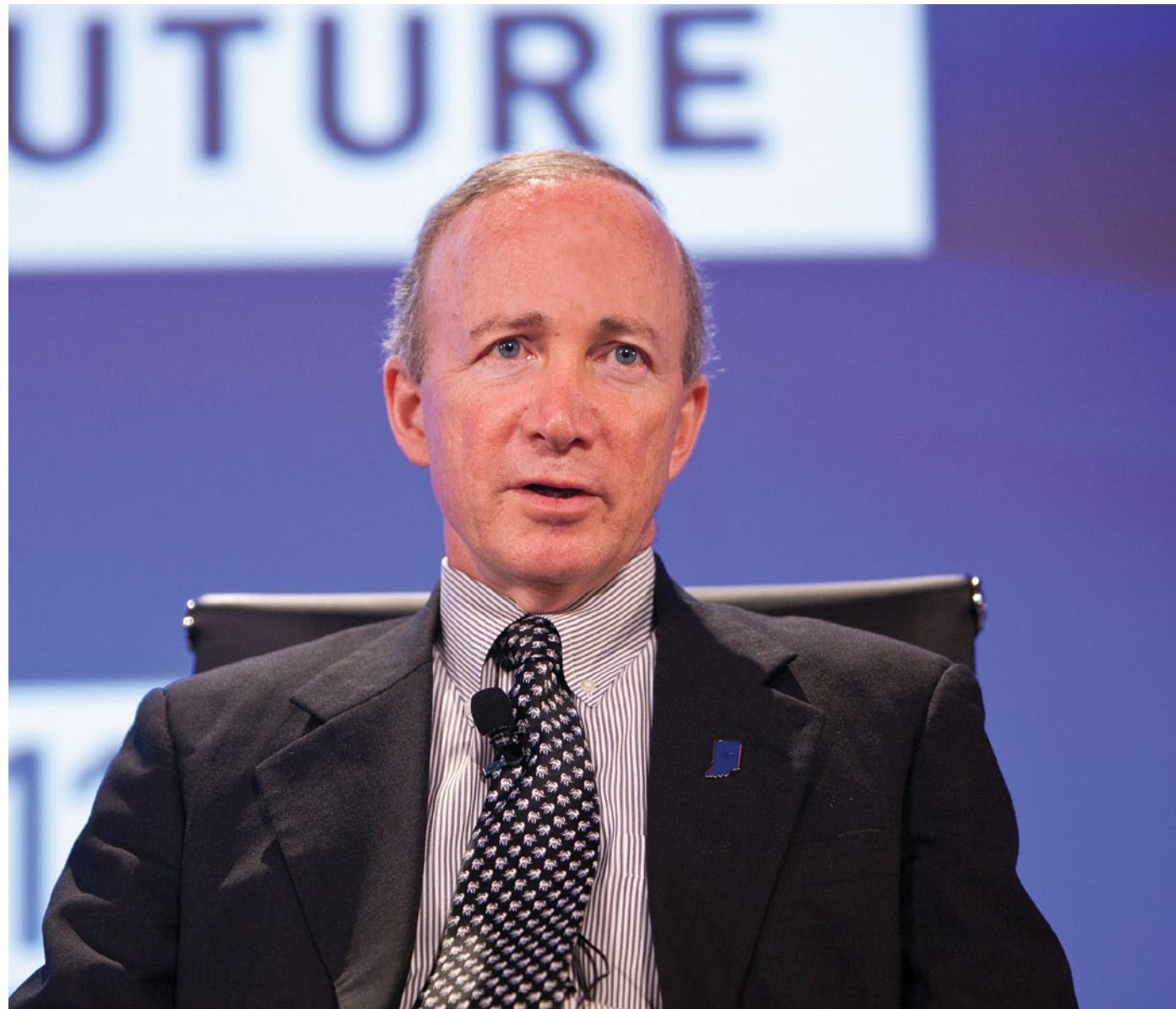
Governor Mitch Daniels

GOVERNOR MITCH DANIELS INTERVIEWED BY GEORGE WILL