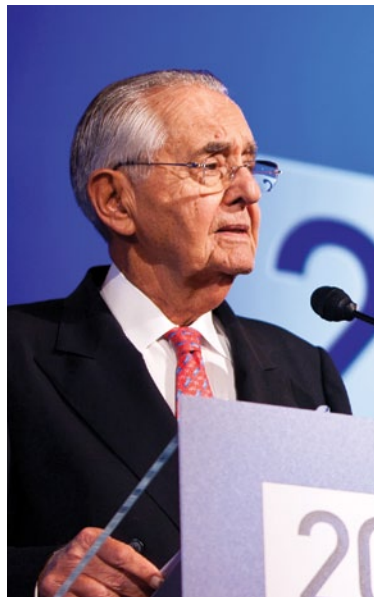
Peter G. Peterson

Foundation chairman Pete Peterson opened the 2011 Fiscal Summit with remarks highlighting progress made since last year's Summit. He praised the work of the National Commission on Fiscal Responsibility and Reform, led by Erskine Bowles and former Senator Alan Simpson, and noted that President Barack Obama and House Budget Committee Chairman Paul Ryan have both issued frameworks for long-term deficit reduction, and two bipartisan groups – one in the Senate and one led by Vice President Joe Biden – continue to work on a long-term agreement.