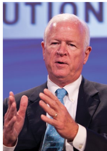
Senator Saxby Chambliss